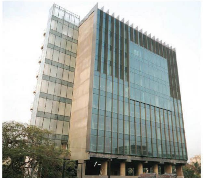
Fern Residency, Mumbai