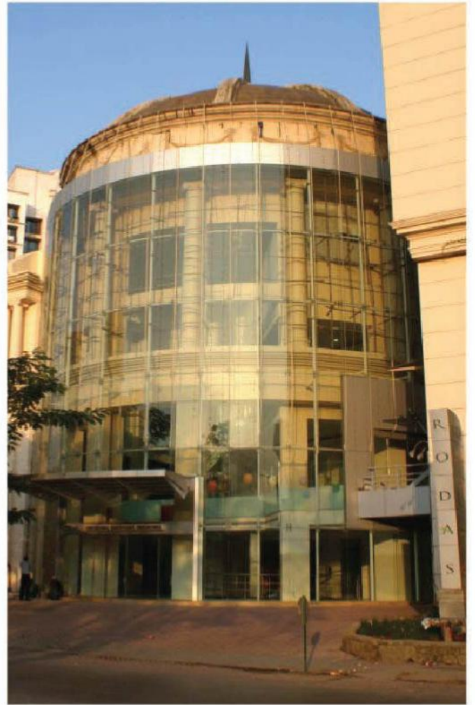
Hiranandani Haiko Mall, Mumbai