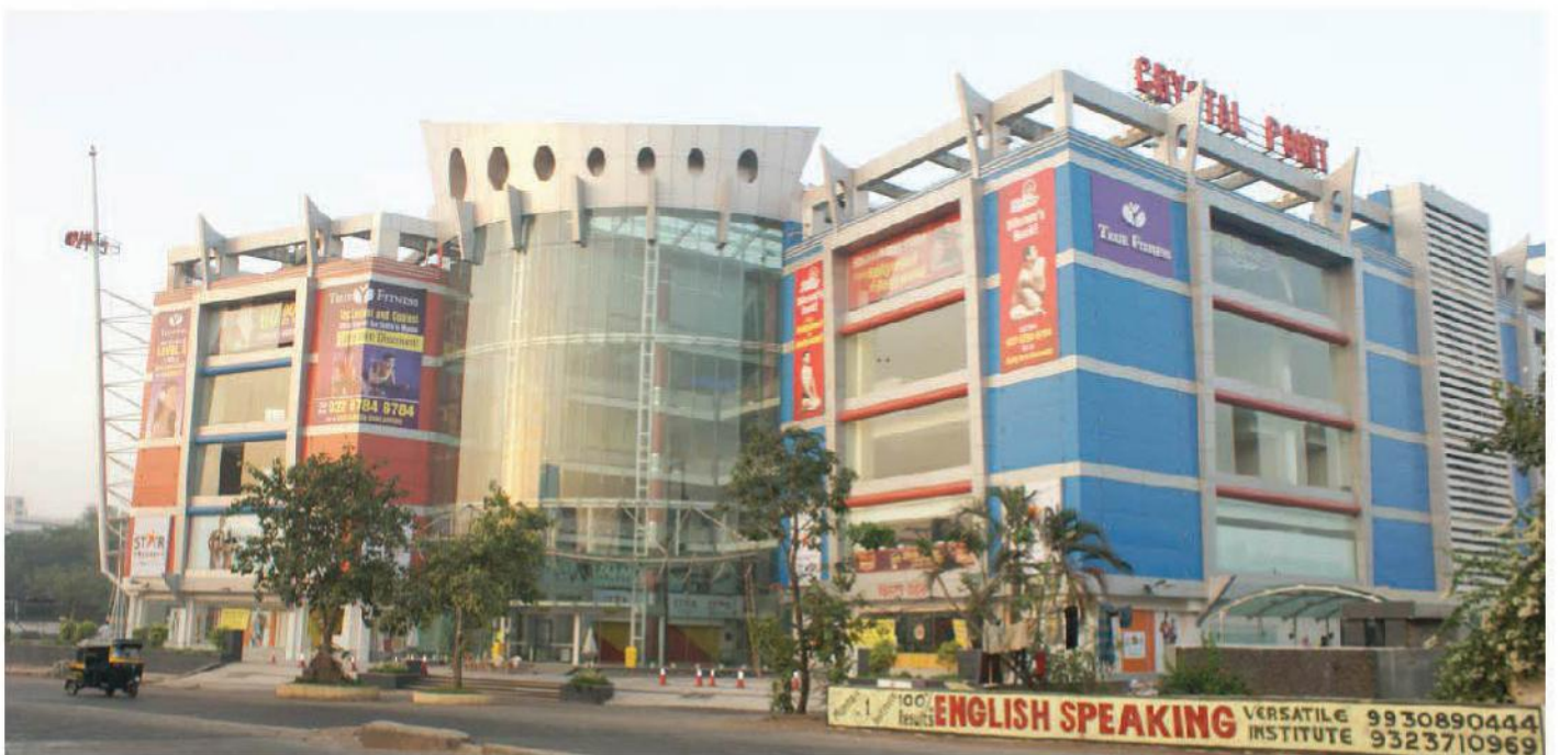
Crystal Point, Mumbai