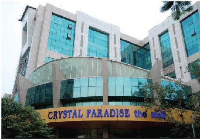
Crystal Paradise, Mumbai