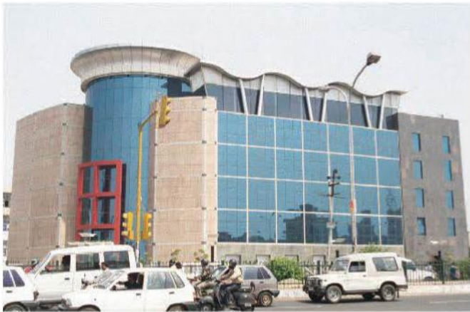
SAB Mall, Noida