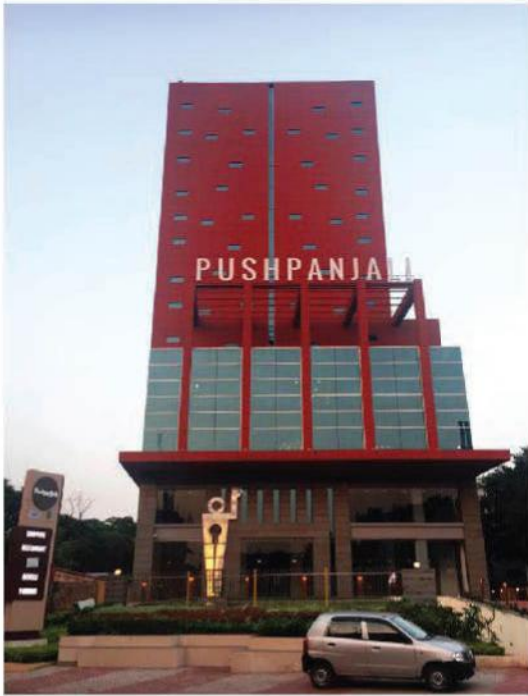
ITC Fortune Hotel, Durgapur

Unconventional hotel designs are best curated with Facades. It's fully tempered and heat soaked glass, flexible nature and excellent weather resistance makes it sustainable while the materials used also add to the aesthetic appeal of the building.