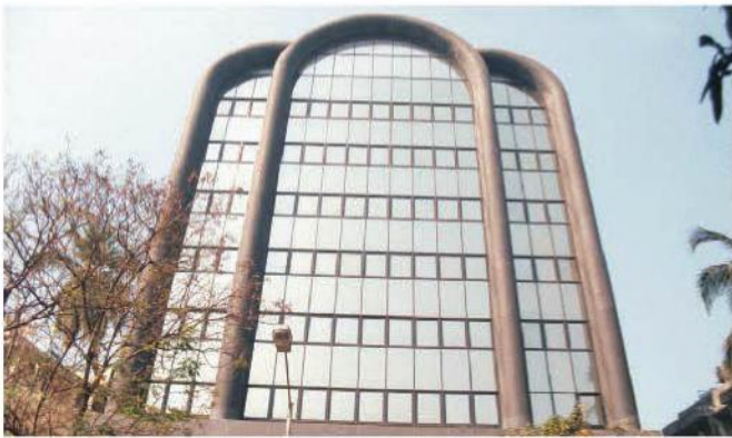
Makhija Chambers, Mumbai