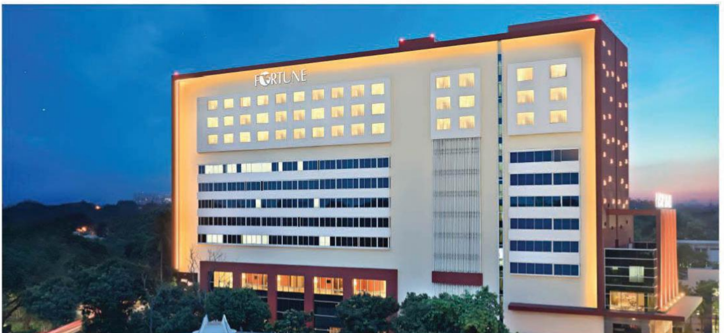
ITC Fortune Hotel, Durgapur