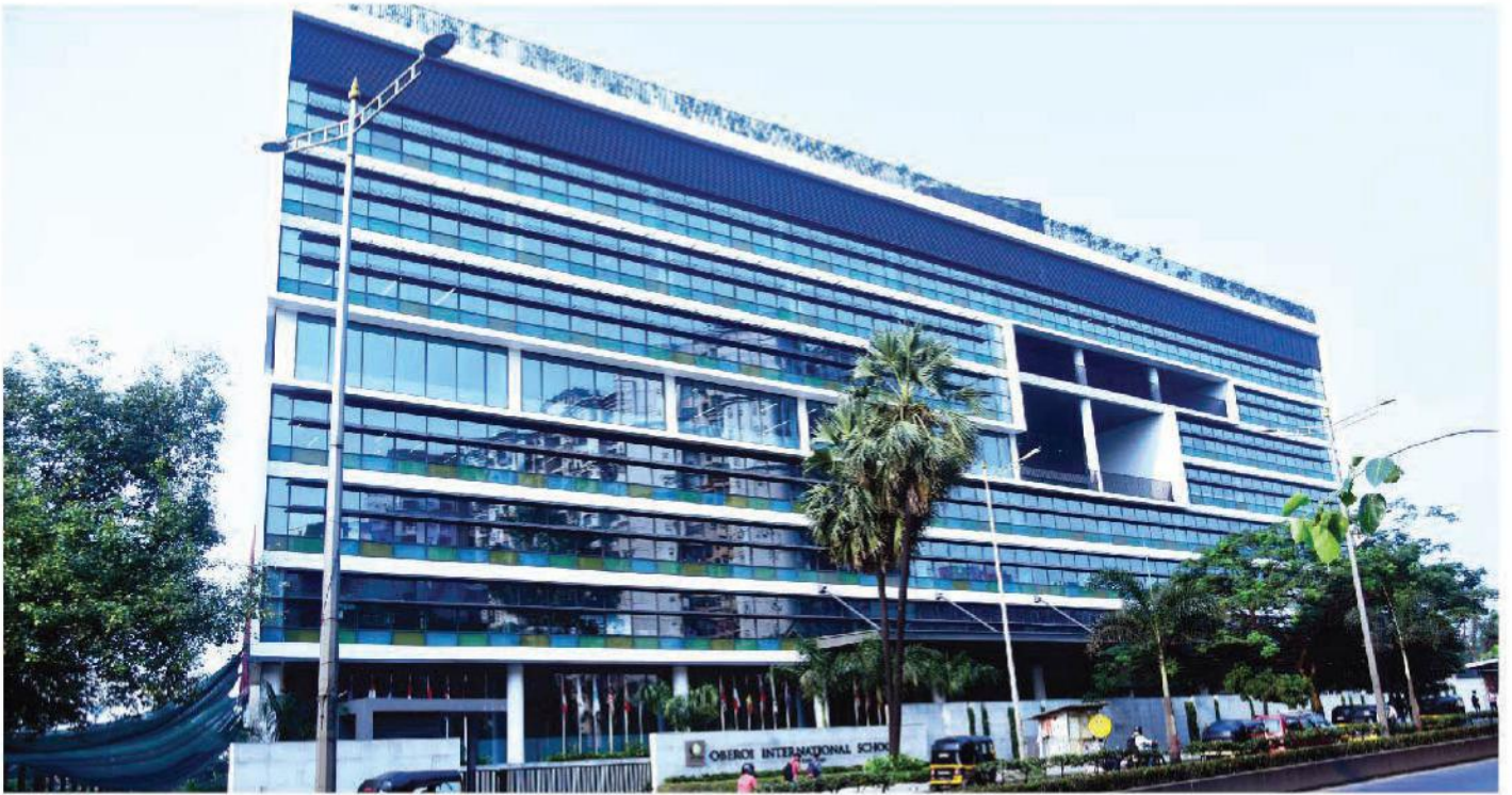
Oberoi International School, Mumbai