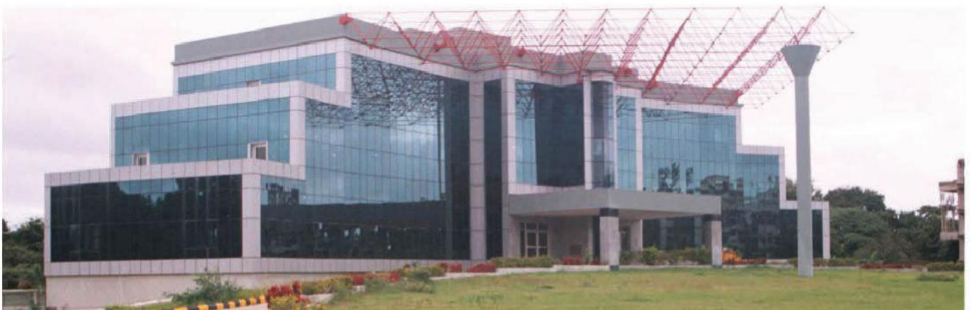
Currency Note Press, Nashik