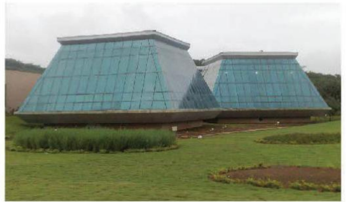
Sahara Amby Valley, Lonavala